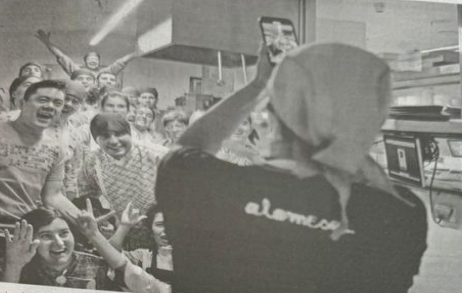
A group photo in the kitchen during the grand opening of the popular Buenos Aires restaurant Alamosa on March 1. The overriding goal of Alamosa is to provide a safe and healthy work environment for its employees.