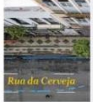
Rua da Cerveja

Um estudo do Instituto Brasileiro de Geografia e Estatística (IBGE) divulgado nesta quinta-feira mostrou que o Brasil registrou um aumento de 10% no número de casamentos em 2023 em comparação com 2022.