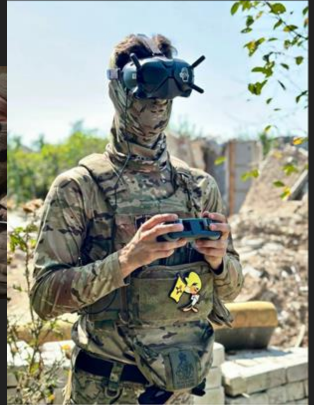
A Cyberpunk-style Ukrainian FPV drone operator equipped with a REB backpack (radio EW system)