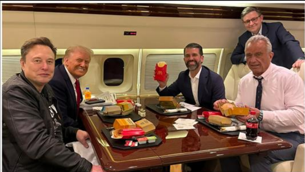
President-elect Trump shared a McDonalds meal with Elon Musk, Donald Trump Jr., House Speaker Mike Johnson and Robert F. Kennedy Jr.

As of early 2024, there are nearly 6,000 Starlink satellites in orbit. Eventually, SpaceX plans to build a massive constellation of 12,000 satellites, with a possible expansion to 42,000 satellites later on. Watch the video to see how the number of Starlink satellites in the Earth's orbit has changed over time. 2 days ago